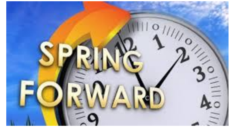
We changed our clocks ahead one hour last night. It occurs to me that if you were depending on me to remind you, I should have done it last week. Anyway welcome to one hour later.