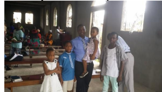
Some of the orphans at Church

On the 29th of this August, I am still going to take the risk to travel to Buea Church to preach at another wedding ceremony. All this occupation with external duties does not