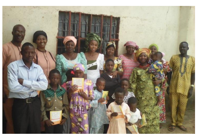
The Church in Foron

During the month of June, I taught 5 Bible