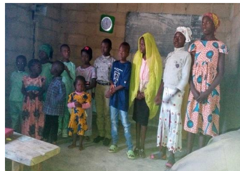
Foron Mission Children presenting their memory verses at the end of the year.

Well, we are still working on him. God is giving us lead way into his heart. The Muslims are taking advance of his poverty to entice him with money.