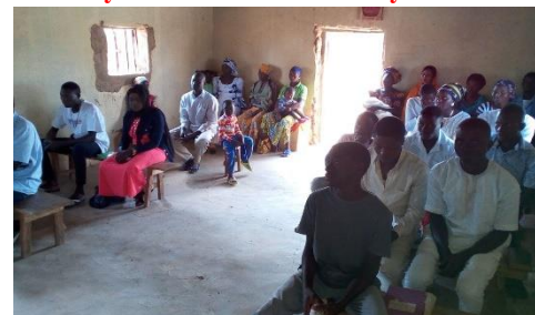
Toro Church of Christ

From the School of Biblical Studies, Jos, throughout the month of December, we were on holiday, except for the various extension centers we went to teach local preachers. I went down to Delta State, where we have 3 extension centers going on in that area. The congregations are small, but with great zeal for God. Since the congregations cannot afford to pay preachers, members have volunteered to be trained to preach. And since most of them have their businesses, they cannot come over to Jos for schooling. That is why we have to take the school to them in their respective localities. We equally opened another training center in Gombe for those who cannot speak English. The program runs for two week for each contact. We are grateful because all our staff are back on campus safely. The school resumes for the second semester of 2019/20 on the 13 th January. Please, join us in prayers for safe travels of our students. We pray to God to grant us a peaceful year ahead. Permit me to use this medium to appreciate you all for making huge sacrifice to assist us preach the Gospel. This help has reached many other people you may not estimate in Africa. Thank you so much.