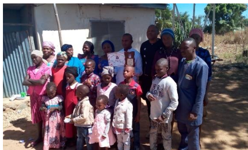
Foron Church of Christ

The year started well, but still on the mood of celebration, we lost a young boy of 20 years in the Ring Road Church of Christ.