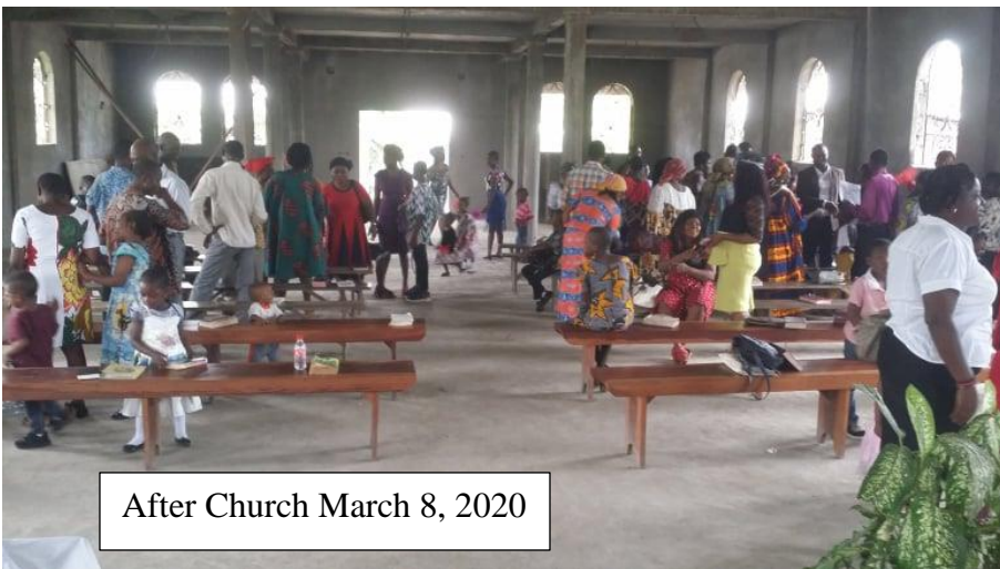
After Church March 8, 2020